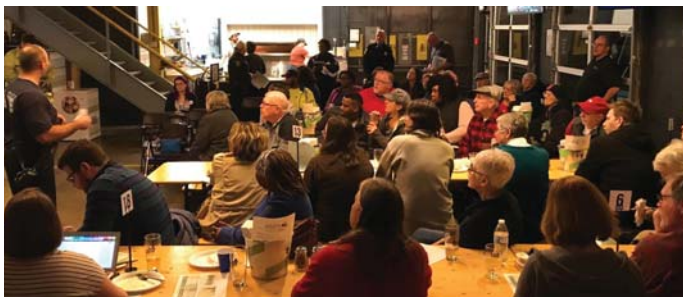
January Community Council meeting at Taft's Brewpourium