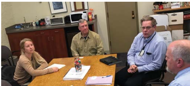
December traffic safety meeting with DOTE at City Hall

We have requested a Traffic Study for cut-through traffic in our neighborhood. We would like to reconfigure the Derby/Este and Derby/Winton intersections to mitigate the high traffic volume that poses both congestion and speeding through SGV.