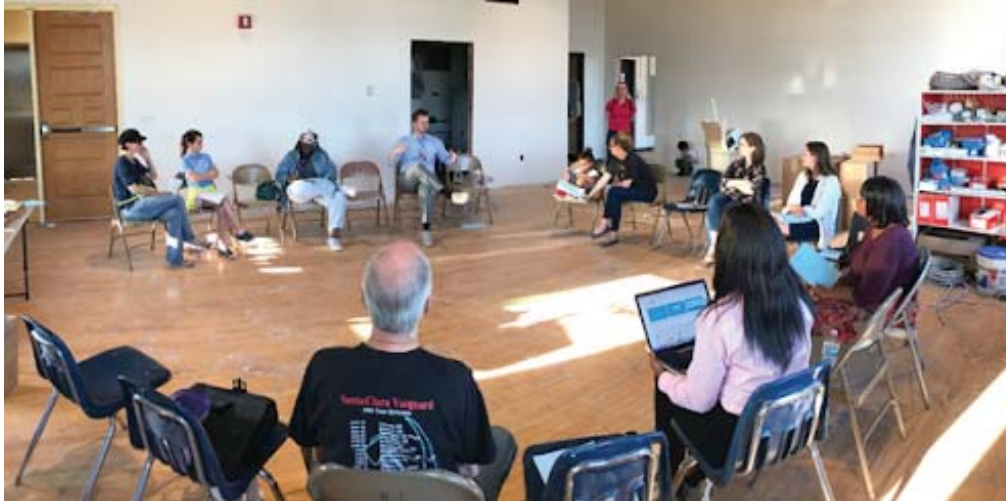
June Community Council meeting at CANS