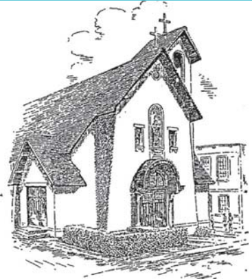
St. Bernard's Catholic Church

The houses of worship in this neighborhood have reached out to their neighbors in a true sense of community. St. Bernard has been especially sensitive to its role as a "neighbor." We greatly appreciate the church and its people, and wish all of you hundreds more years in this wonderful community. We are determined to see that you feel as welcome here as you make all of your neighbors feel.