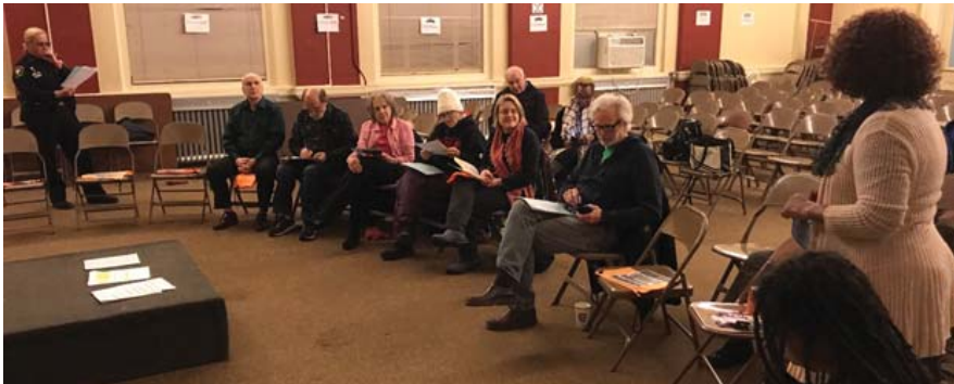
February SGV Community Council Meeting at Winton Prep