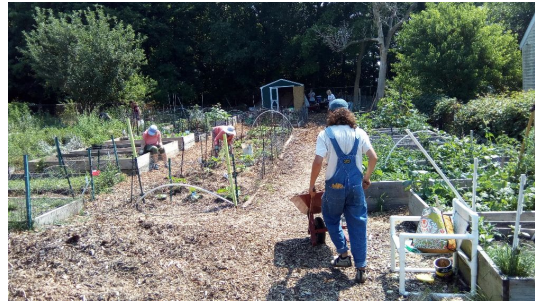
SGV Garden Work Day!