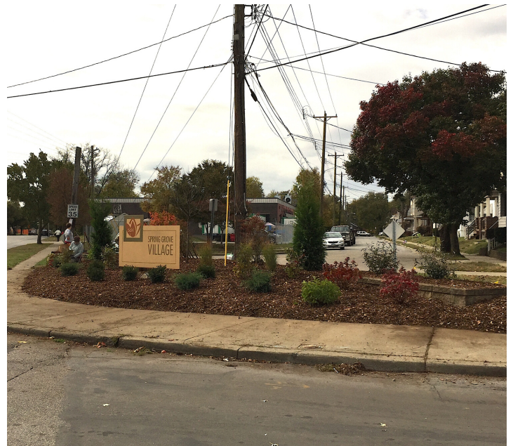
Final transformation! (November)