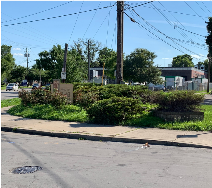
Before landscaping project (June)