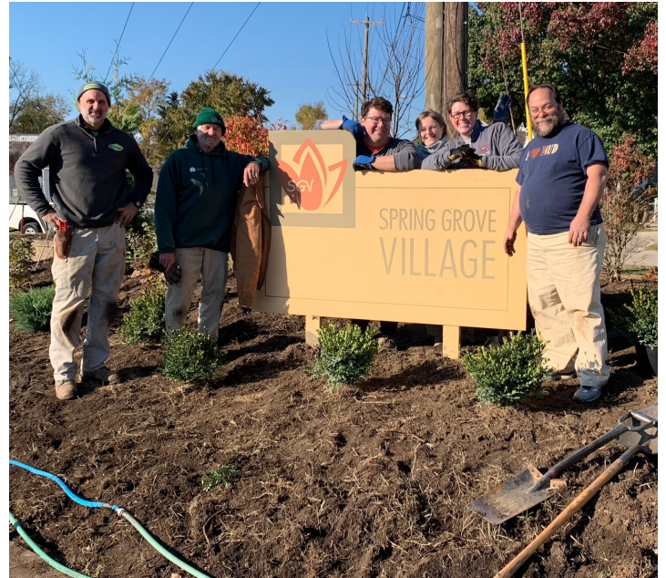
Thanks to our early volunteer crew who came bright & early!