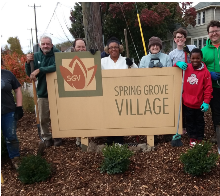
Thanks to our volunteer crew later in the day!